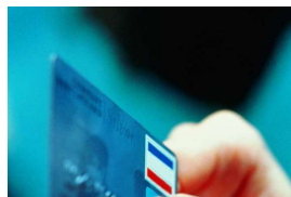
Credit card debt picking up pace